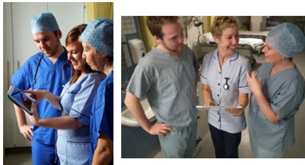
Audit with immediate feedback using TS+ Auditing Technology

Results of observational audit data were compared over 3 data periods to determine any impact.